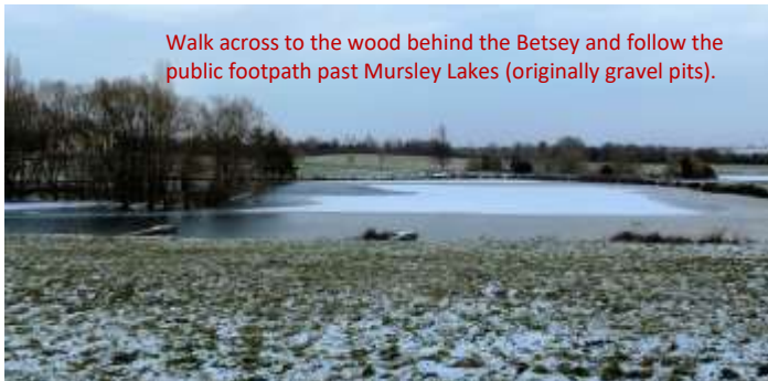
Walk across to the wood behind the Betsey and follow the public footpath past Mursley Lakes (originally gravel pits).

1. Start from path behind the Betsey. Go through wood and walk towards Mursley