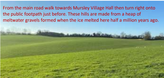
From the main road walk towards Mursley Village Hall then turn right onto the public footpath just before. These hills are made from a heap of meltwater gravels formed when the ice melted here half a million years ago.